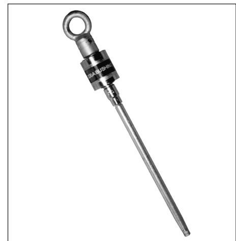
Figure 4. Insert installation torque tool.