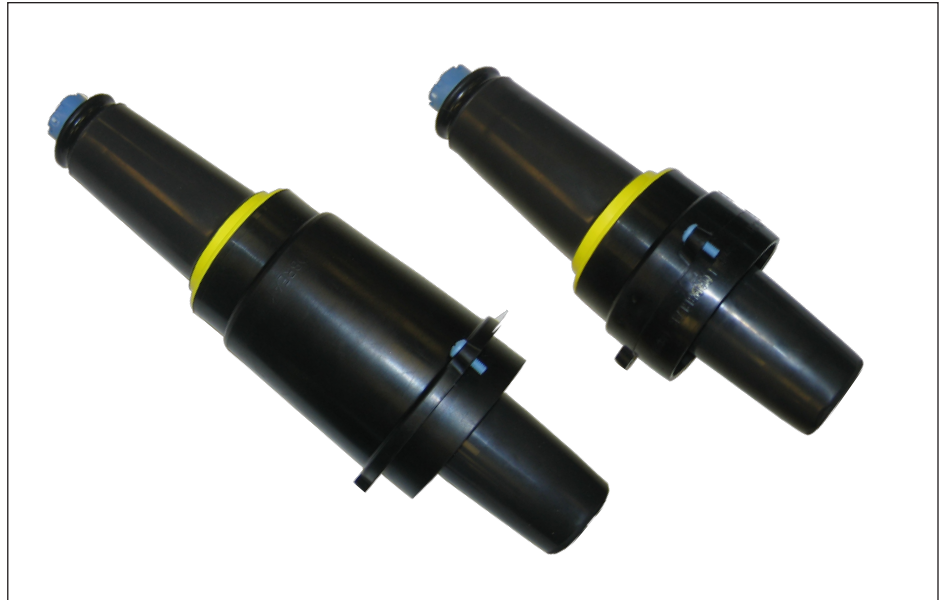
Figure 1. 25 kV Loadbreak Bushing Insert with latch indicator for applications in transformers, switches, and other apparatus (right). Longer version for use whenever increased clearance from the equipment faceplate and underground cables are required (left).

The bushing insert meets all the requirements of IEEE Std 386™ standard – latest revision and is completely interchangeable with mating products that also meet IEEE Std 386™ standard. When mated with a comparably rated component, the bushing insert provides a fully shielded and submersible connection for loadbreak operation.