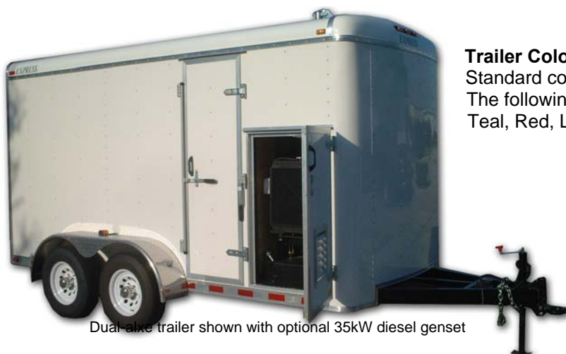
Dual axle trailer shown with optional 35kW diesel genset