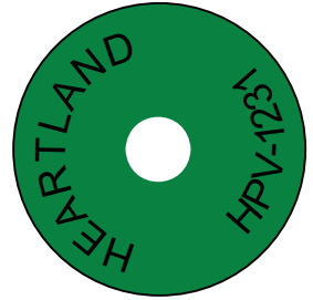
PROTECTIVE SHIELD / CAP