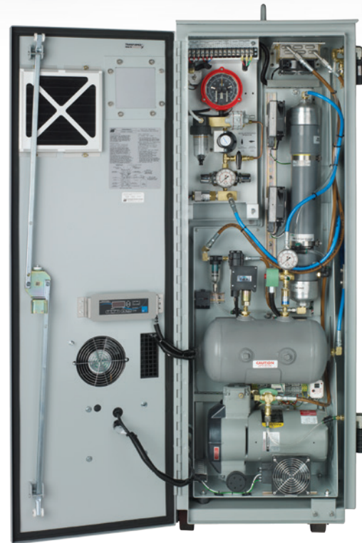
Inside view of Waukesha® 2nd Generation Nitrogen Generator System