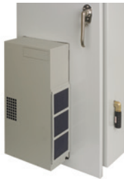
Climate Control Assembly Box is located on the outside of the cabinet.

System's climate control module maintains a constant temperature inside the cabinet to provide the ideal environment for producing nitrogen of the highest purity.