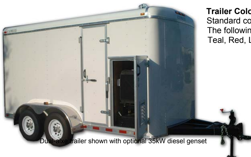
Dual-axle trailer shown with optional 35kW diesel genset