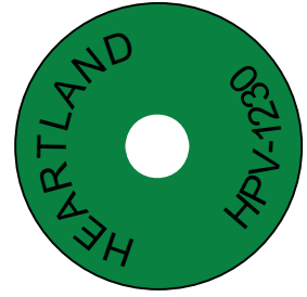
PROTECTIVE SHIELD / CAP